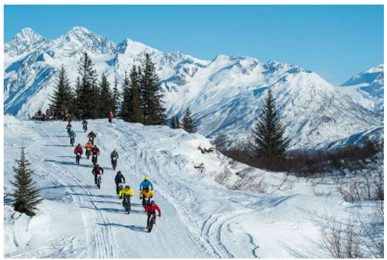
Fat bikers compete in a race on Meals Hill at the Valdez Fat Bike Bash in 2017.

Miners rowing towards shore in 1898 to offload mining supplies and start the trek over Valdez Glacier and into the Alaska gold fields. The dark piece of land is Meals Hill.