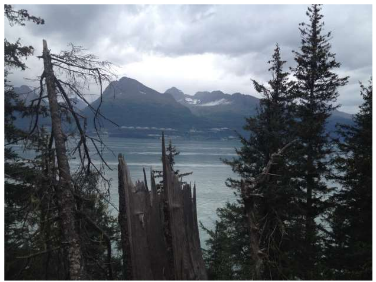
Looking out across the bay from Meals Hill.